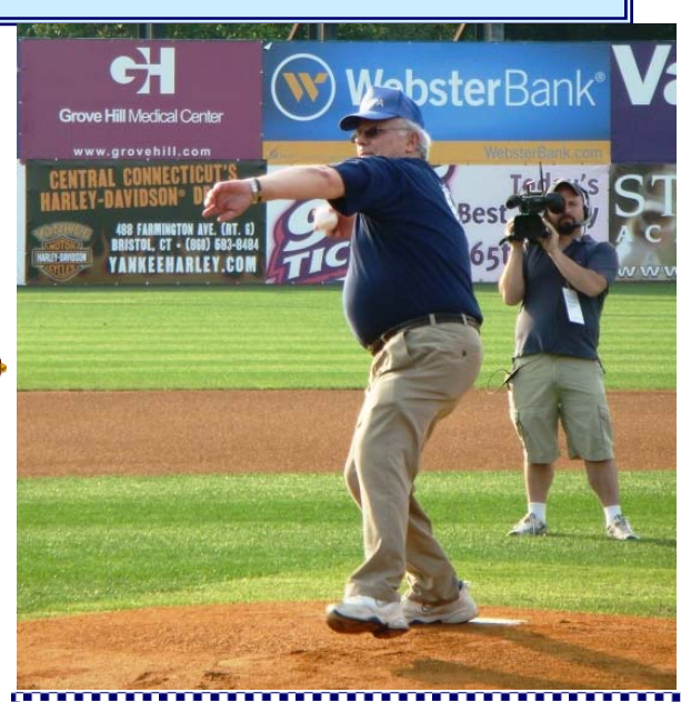
District Governor Emmanuel Moshovos throwing the first pitch out.