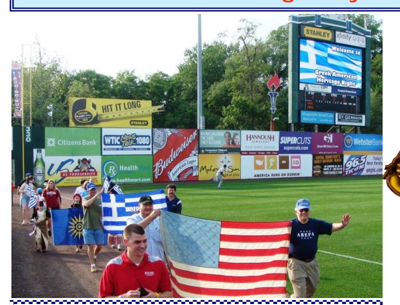
Members of the Daughters of Penelope and the AHEPA lead the parade around the baseball field on GREEK NIGHT at the Ballpark